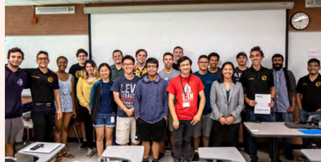
Check presentation to the California State University Long Beach Rocketry Team.