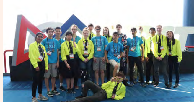
FIRST team Swerve Robotics (Team 8923) from Woodinville, WA at the World Competition.