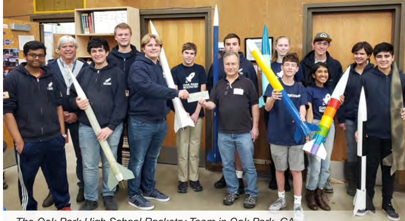
The Oak Park High School Rocketry Team in Oak Park, CA.