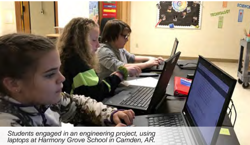
Students engaged in an engineering project, using laptops at Harmony Grove School in Camden, AR.