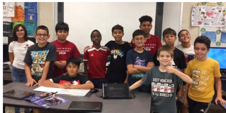
Students from the Project Lead the Way program at Freedom Middle School in Orlando, FL are thankful for the contribution from the foundation.