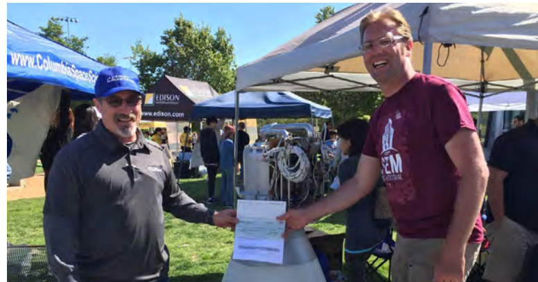
City of STEM event at the Columbia Memorial Space Center in Downey, CA where the foundation was a proud supporter.