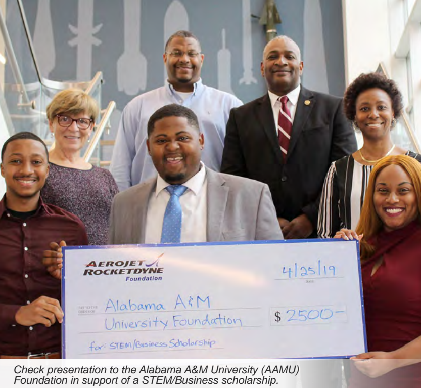
Check presentation to the Alabama A&M University (AAMU) Foundation in support of a STEM/Business scholarship.