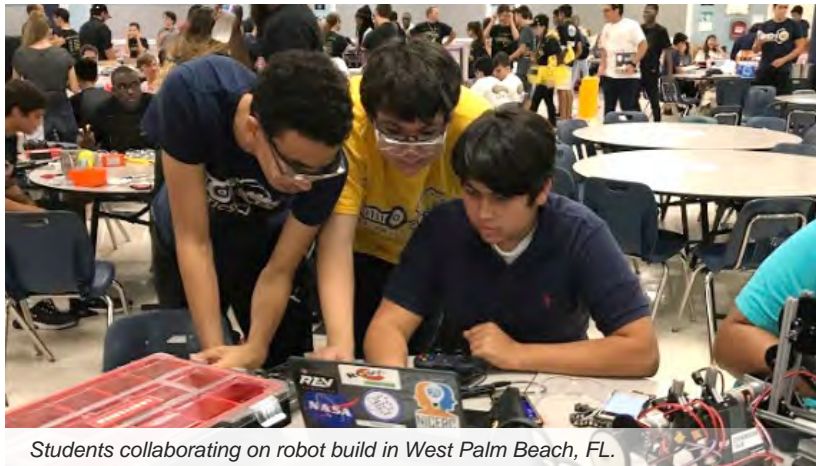
Students collaborating on robot build in West Palm Beach, FL.