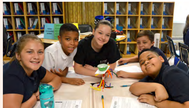
The STEM Club at Little Oak Middle School in Slidell, LA.