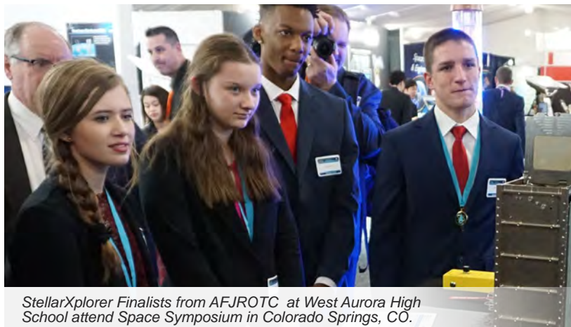
StellarXplorer Finalists from AFJROTC at West Aurora High School attend Space Symposium in Colorado Springs, CO.

The Aerojet Rocketdyne Foundation's mission is to support the communities where the company has a business presence. The foundation's primary giving focus is education, with an emphasis on STEM - Science, Technology, Engineering and Mathematics. In 2019, the Aerojet Rocketdyne Foundation made contributions in 15 communities across the United States: Huntsville, AL; Camden, AR; El Segundo, CA; Los Angeles, CA; Sacramento, CA; Washington, DC; Daytona Beach, FL; Orlando, FL; West Palm Beach, FL; Stennis, MS; Carlstadt, NJ; Socorro, NM; Jonesborough, TN; Orange, VA; and Redmond, WA.