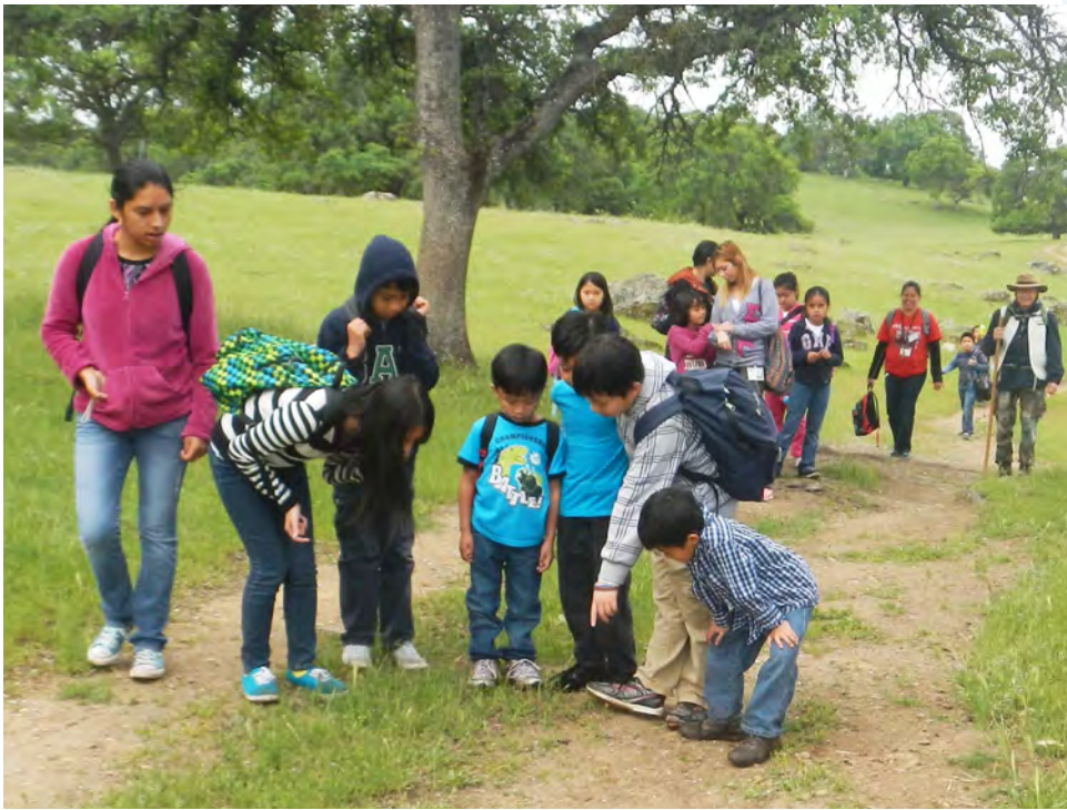
Left: Students on a nature hike at Deer Creek Hills, made possible by a GenCorp Foundation grant to the Sacramento Valley Conservancy.

National Merit Scholarship Corporation National Defense Industries Association New Mexico Tech Northeast State Community College Foundation Northern Virginia Community College Educational Foundation Northwestern University Ouachita Area United Fund Ouachita Baptist University Pacific Science Center Foundation RAFT-Resource Area for Teaching Sacramento Regional Science & Engineering Fair Foundation Sacramento Valley Conservancy San Juan Education Foundation SAU Foundation SAU Technology Foundation Sci-Quest Society of Women Engineers Socorro High School Soil Born Farms Spotsylvania High School STEDTRAIN Sulphur Springs School The Schools Foundation Thomas Jefferson High School for Science & Technology Tusculum College United States Space & Rocket Center University Foundation at Sacramento State University of Alabama in Huntsville University of Arkansas University of California, Berkeley